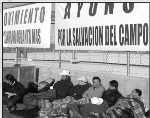
Farmers protest on Cordova International Bridge

Visit www.apen4ej.org for the full LOP statement.